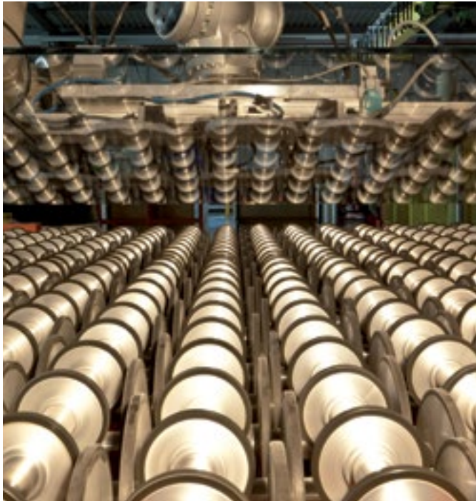
The world’s first floated Borosilicate Glass. Made in Germany with IQ.

BOROFLOAT® 33 from Germany is the world’s first floated borosilicate flat glass. Its superior quality and excellent flatness combine with outstanding thermal, optical, chemical and mechanical features. The chemical composition of BOROFLOAT® 33 is in accordance with ASTM E 438-92 (2001), Type 1, class A. Rediscover BOROFLOAT® 33 and experience the infinite potential of our most versatile material platform. BOROFLOAT® – Inspiration through Quality.